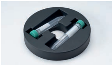
Conical Tube Holders For uniform dosimetry and "no spill" positioning.