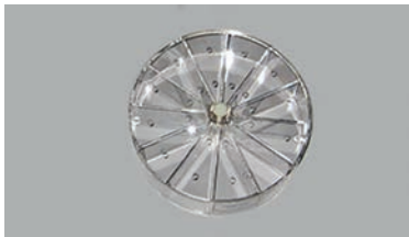
Pie Cages Total body irradiation pie cages available for both mice and rats.