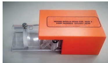
Exposed Shield Available in two sizes for both head and abdomen. (Fixtures sold separately)