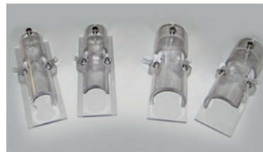
Holding Fixtures Clear, acrylic fixtures available in two sizes.

For a complete list of options and accessories, please visit www.precisionxray.com/accessories