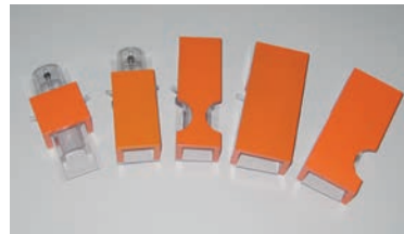
Holding Shields Painted lead, 5mm shielding available in two sizes. (Fixtures sold separately)