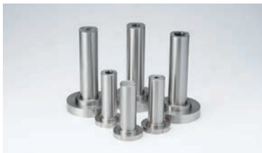
Fixed Collimators For targeted irradiation studies.

Options and accessories are available for purchase as part of the system configuration or at a later date. Purchase what you need today, knowing that the system will grow with you as your needs change.