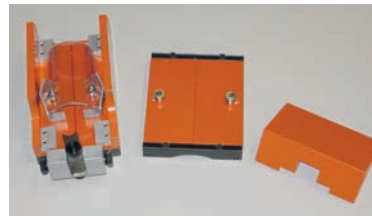
Head and Spine Shield Fitted with special bite bar and nose clamp assembly.