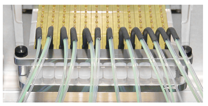
12 ingredient inputs with tubing that can be used with any virtually any container

TEMPEST is capable of returning any excess sample from the microfluidic chip back into the ingredient reservoir, rendering an impressively low dead volume of less than 40 \mu L. A pipette tip can be used as an ingredient reservoir yielding a dead volume of only 100 \mu L.